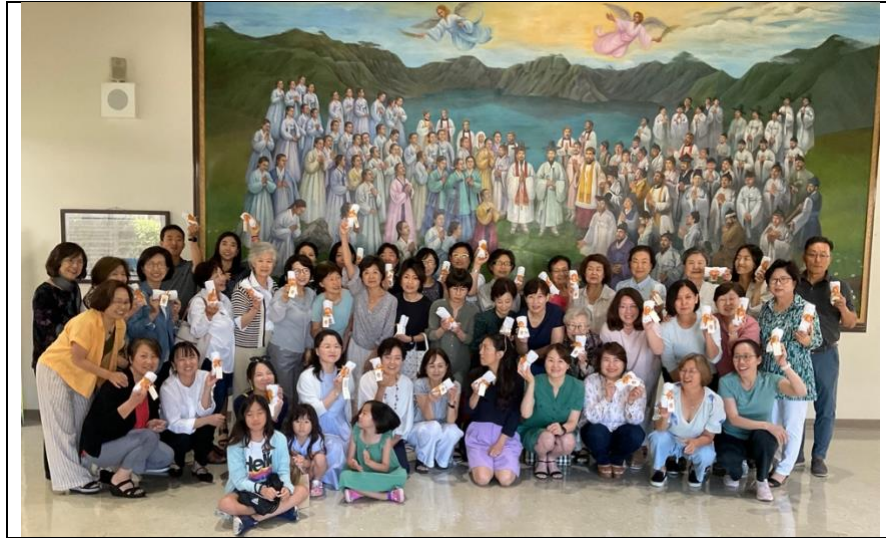
Members are holding kitchen towels with the logo <Ba.Ddu.Ja>

We plan to use the logo drawn by one of our KCLC member for future products produced by <Ba.Ddu.Ja>