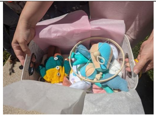
Gift box for a newborn baby