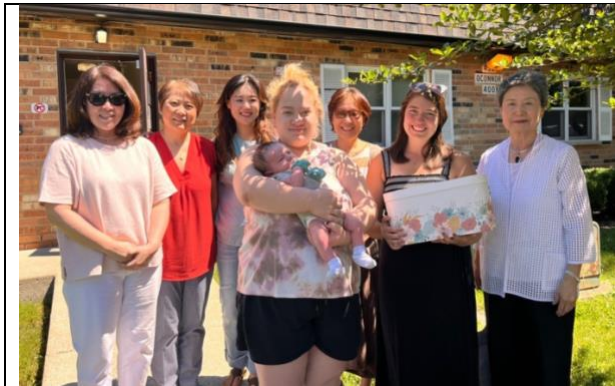
The planning team of <Ba.Ddu.Ja> visited Heather House.

Members have learned a lot from this experience and look forward to continuing to contribute to the community through volunteer work.